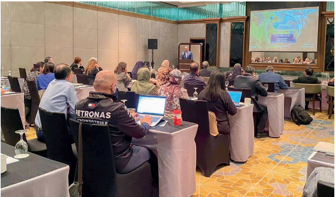
Board Training on Conflicts of Interest and Creating Impactful Leadership for Sustainability Capacity Building

Cognisant that effective sustainability leadership requires ongoing education, we provide targeted training for our Board members. On 5 December 2023, we organised two sessions on the topics of Conflicts of Interest and Sustainability, each taking up a half-day. The morning session focused on ethical governance, specifically on managing risks related to conflicts of interest; while the afternoon session centred on cultivating impactful leadership by equipping board members with the knowledge and tools needed to integrate sustainability principles into decision-making.