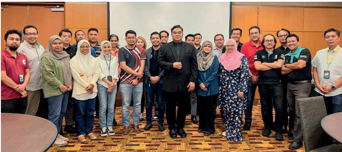
ABMS specific awareness and knowledge transfer

We curated training for specific target group to ensure effectiveness of the training.